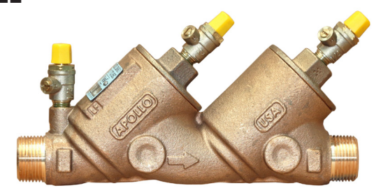
Sizes 20mm - 50mm

During normal flow conditions, the two check valves are held off their seats, supplying water downstream. Each check valve is designed to maintain a minimum of 7 kPa across the valve during normal operation. Should the downstream pressure increase to within 7 kPa of supply pressure, both check valves will close to prevent a backflow condition.